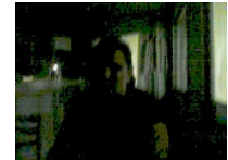
Figure 3. Achieving awareness in the Story "evening" (description "Night," initiator Mikko), between members at different pubs.

Msg 21 AleksiV Sun 01:59:19 We could not get in the bar