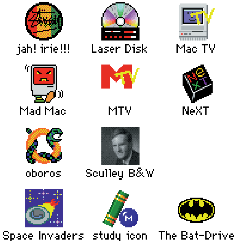
Figure 2. We wish to convert all the PICT files into icons. This task involves several steps and would be very difficult to accomplish with direct manipulation. A simple scripting language provides a natural specification of the task.

A s an example of the limitations of the desktop metaphor, consider the trash can on the Macintosh desktop. It is a fine metaphor for the wastebasket in an office. In both cases we dispose of objects by putting them in the trash can and we're able to retrieve documents we had thrown out until the trash is emptied. However, the limits of the single-trash-can metaphor has led to a system that fails to meet the user's needs and causes confusion by masking the realities of the implementation. In the underlying implementation, there are separate trash containers for each volume, such as a hard disk or a floppy disk, but to avoid the confusion of multiple trash cans in the interface, the contents of the trash containers for all mounted volumes are combined and shown as a single desktop trash can. Because there is only one trash can in the metaphor, if the user empties the trash to create room on a floppy disk, the trash contents on both the floppy and the hard disk are deleted, even though there was no need to delete files from the hard disk's trash can. The desktop metaphor has enforced a limitation on the interface that does not serve the user's real needs. An alternative approach would be to simply cross out files and have them disappear (perhaps to a temporary limbo before being permanently discarded). This approach avoids the problems caused